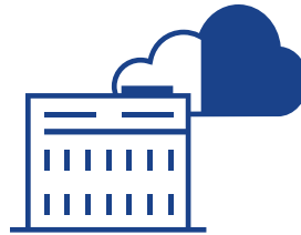
Where key applications and data reside