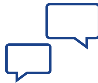
How leadership and employees currently (and will be expected to) communicate and collaborate