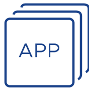
What applications employees need

The steps leadership takes now to boost digital employee experience can quickly become the foundation for digital business or mission advantage later. That's if IT and executive teams understand and agree on some basic, not necessarily new, principles: